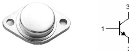
Fig.1 simplified outline (TO-3) and symbol